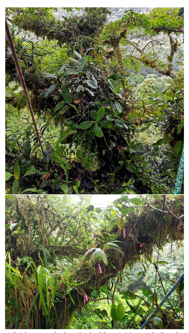
Figure 3. Epiphyte examples from the cloud forest in Monteverde, Costa Rica. Two views of branches in the tree canopy. The branches are extensively covered with epiphytes (non-parasitic plants). Note the pink ribbons used to mark specific plants for study and climbing ropes (used to access the canopy).