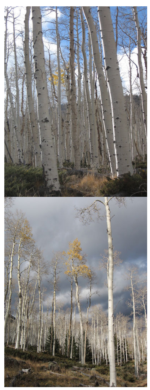
Figure 2. Two autumn views of the Pando grove of quaking (trembling) aspen, Fishlake National Forest, Utah, United States. Most of the aspen trees had lost their leaves in preparation for winter.