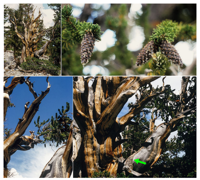
Figure 1. Bristlecone pine in Wheeler Peak Grove, Great Basin National Park, Nevada, United States. Top left, a bristlecone pine tree. Top right, bristlecone pine cones, its "fruit." Note the namesake bristles on the cones. Bottom, old bristlecone pines often have just a small portion living (bottom left). Regions such as these are connected to the roots by a thin strip of living tissue and bark around a small portion of the trunk and connecting branches (bottom right, green arrow).

petrified, their living cells becoming replaced by minerals that turn into rainbow-colored rocks.