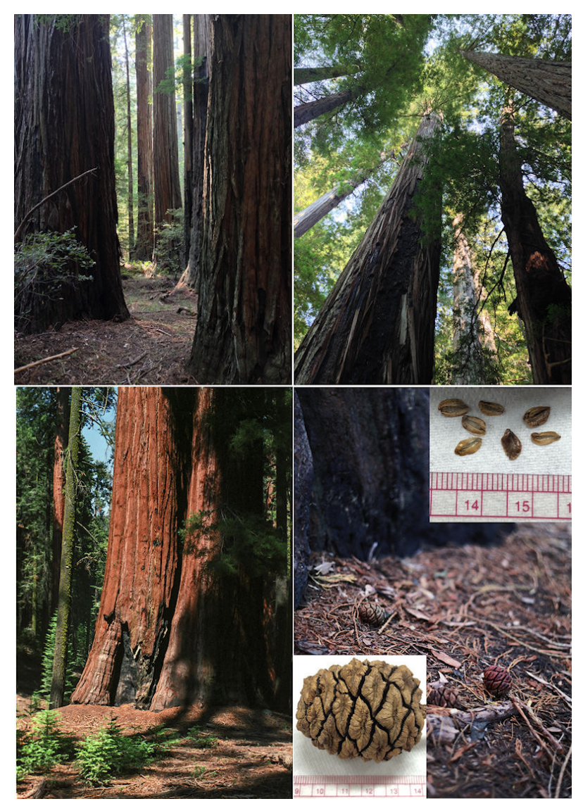
Figure 7. Two types of redwood trees. Top row, two views of coastal redwood ( Sequoia sempervirens ) trees in Humboldt Redwoods State Park, California, United States. Bottom row, two views of giant sequoia ( Sequoiadendron giganteum ) in Kings Canyon National Park, California, United States. Note the fire scar on the tree (left). Right, giant sequoia cones near the base of a trunk. Note, again, the burnt trunk. Insets, a giant sequoia cone (bottom left) and seeds from that cone (top right). These are from a tree growing in suburban Salt Lake City. Scale is millimeters (smallest increment) and centimeters (numbered bars). Both coastal redwood and giant sequoia often must deal with fire during their lifetimes, and fire scars are a common site on older trees.