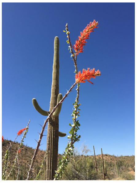
Figure 5. Saguaro and saguaro forest. Foreground, flowering ocotillo in front of a large saguaro. In the background are several more saguaro and this is a saguaro forest. Location is Saguaro National Park, near Tucson, Arizona, United States.

(Enos 1:1-18), and about 450 people knew a forest as a beautiful place because there they "came to the knowledge of their Redeemer" (Mosiah 18:4-5, 30, 35). Countless others have found spiritual nourishment in jungles, woods, and even cactus forests (Figure 5).73 So, in essence, stands of trees are spiritual temples. Even individual trees in wild or non-wild places can give spiritual comfort. Many have sought and found peace at an individual tree. After he was baptized, "Jesus was led up of the Spirit, into the wilderness, to be with God" (Joseph Smith Translation Matthew 4:1-2). Although he was most likely in the harsh Judean Desert, trees such as the acacia and tamarisk do grow there and may have given Jesus physical and spiritual comfort.