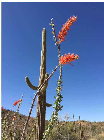
Figure 5. Saguaro and saguaro forest. Foreground, flowering ocotillo in front of a large saguaro. In the background are several more saguaro and this is a saguaro forest. Location is Saguaro National Park, near Tucson, Arizona, United States.

Trees also give examples of righteous principles that a disciple of the Lord should follow. These principles help us overcome temptations and the trials of life. Relating to Lehi’s dream and Nephi’s vision, seeing