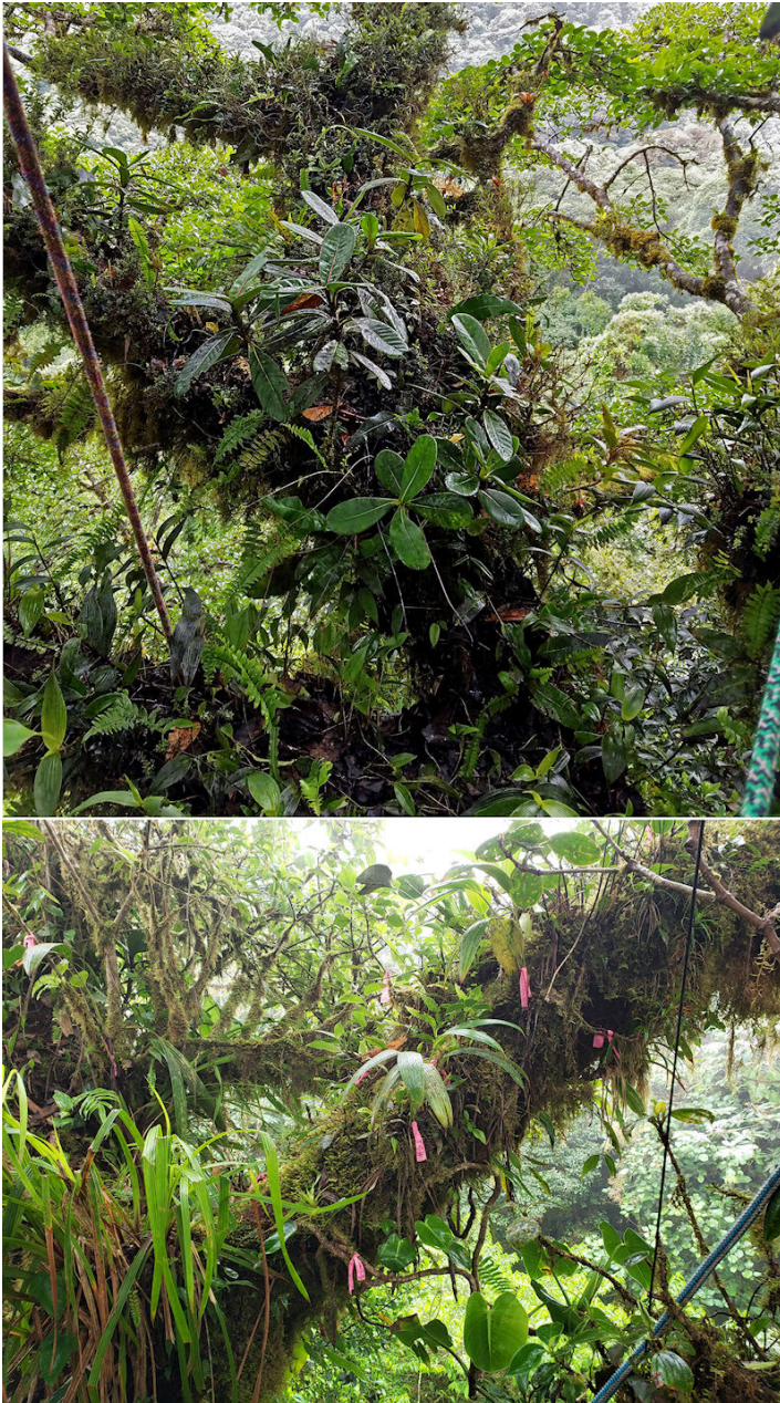
Figure 3. Epiphyte examples from the cloud forest in Monteverde, Costa Rica. Two views of branches in the tree canopy. The branches are extensively covered with epiphytes (non-parasitic plants). Note the pink ribbons used to mark specific plants for study and climbing ropes (used to access the canopy).