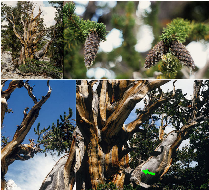
Figure 1. Bristlecone pine in Wheeler Peak Grove, Great Basin National Park, Nevada, United States. Top left, a bristlecone pine tree. Top right, bristlecone pine cones, its “fruit.” Note the namesake bristles on the cones. Bottom, old bristlecone pines often have just a small portion living (bottom left). Regions such as these are connected to the roots by a thin strip of living tissue and bark around a small portion of the trunk and connecting branches (bottom right, green arrow).

petrified, their living cells becoming replaced by minerals that turn into rainbow-colored rocks.