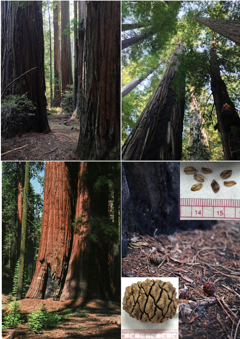
Figure 7. Two types of redwood trees. Top row, two views of coastal redwood ( Sequoia sempervirens ) trees in Humboldt Redwoods State Park, California, United States. Bottom row, two views of giant sequoia ( Sequoiadendron giganteum ) in Kings Canyon National Park, California, United States. Note the fire scar on the tree (left). Right, giant sequoia cones near the base of a trunk. Note, again, the burnt trunk. Insets, a giant sequoia cone (bottom left) and seeds from that cone (top right). These are from a tree growing in suburban Salt Lake City. Scale is millimeters (smallest increment) and centimeters (numbered bars). Both coastal redwood and giant sequoia often must deal with fire during their lifetimes, and fire scars are a common site on older trees.