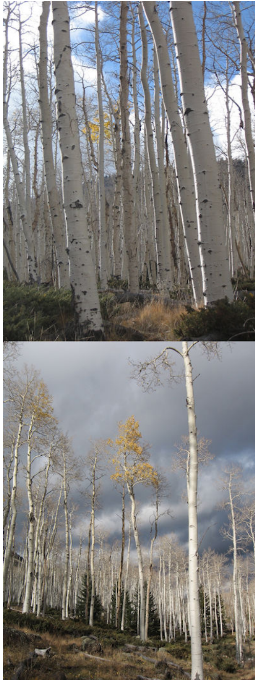
Figure 2. Two autumn views of the Pando grove of quaking (trembling) aspen, Fishlake National Forest, Utah, United States. Most of the aspen trees had lost their leaves in preparation for winter.